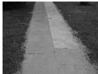
As at 2nd June 2009

Clearly there is a need to have active Councillors who will raise issues such as this directly with the Council and demand that action is taken.