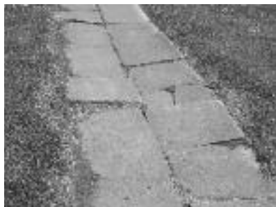
As at 31st May 2009